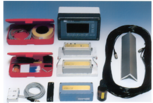
The TPM comes complete with tools, and expendable supplies for 5 installations.

Kyma has a worldwide service network which can provide local support.